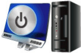
intel Rapid Start

Smart Connect will periodically wake the computer is in sleep state, the things to check for updates and information.