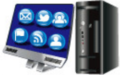
intel Smart Connect